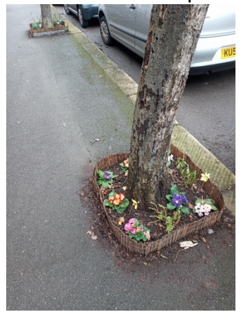
Example "Fairy Garden"

close to trees and potentially damaging their root systems will be tolerated.