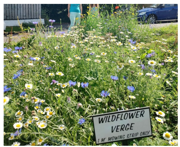
Example site that has been subject to resident involvement during 2022 trials.